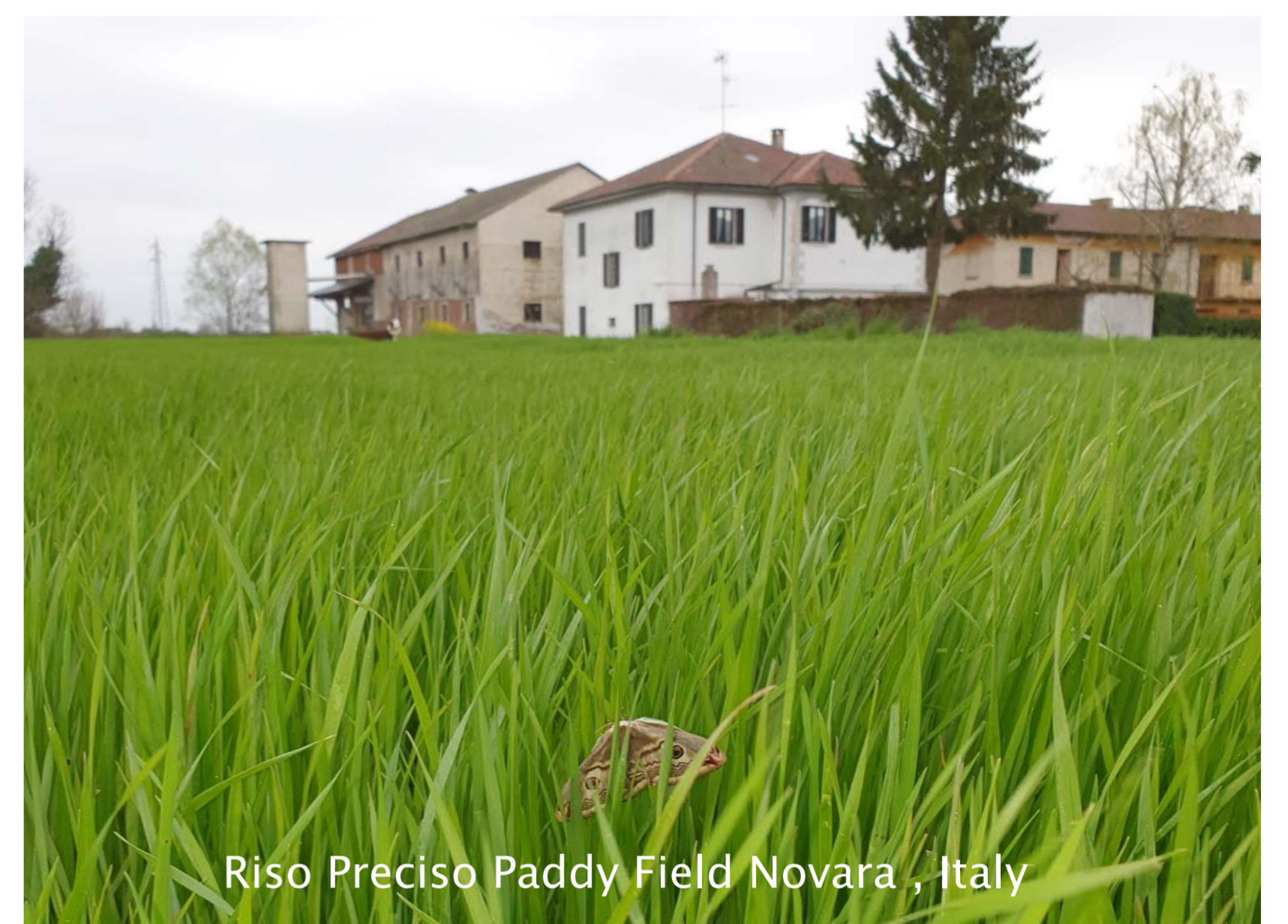
Riso Preciso Paddy Field Novara, Italy