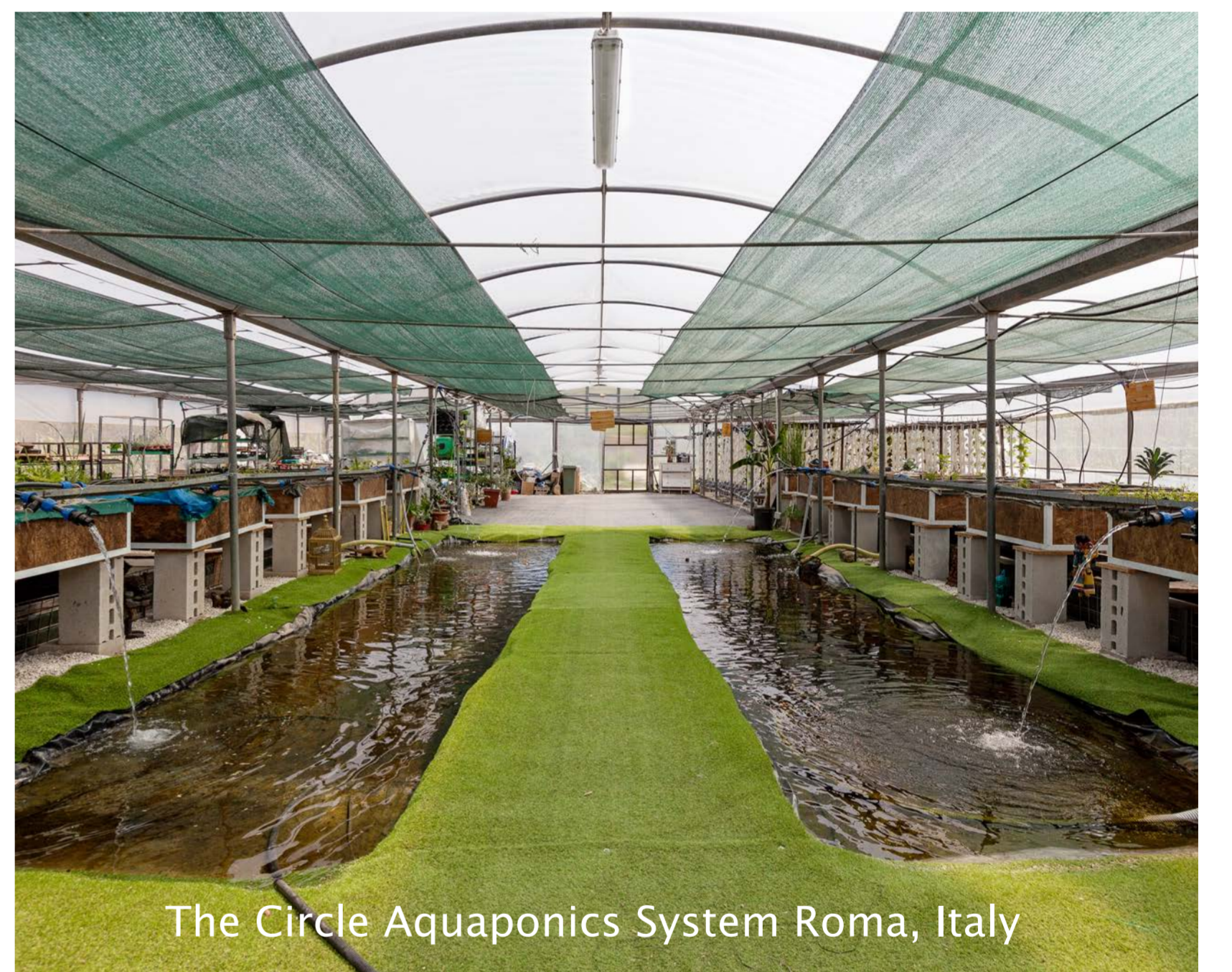
The Circle Aquaponics System Roma, Italy